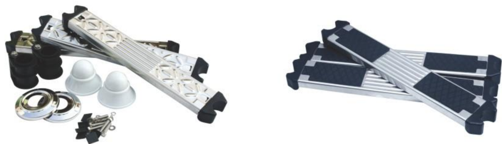
Stainless steel escalator embedded parts

Provide Stainless steel ladder. Can be used for indoor wooden pool or outdoor concrete pool, simplified installation.