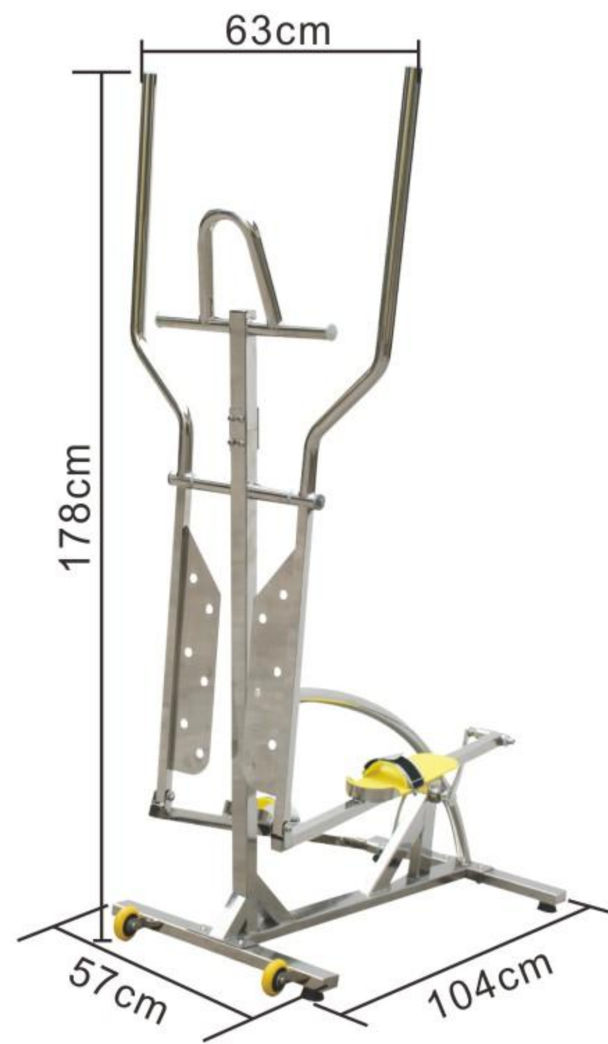
The aquatic stepper

(Package Size): 111x120x29cm (Gross weight): 30kg (Weight): 24kg