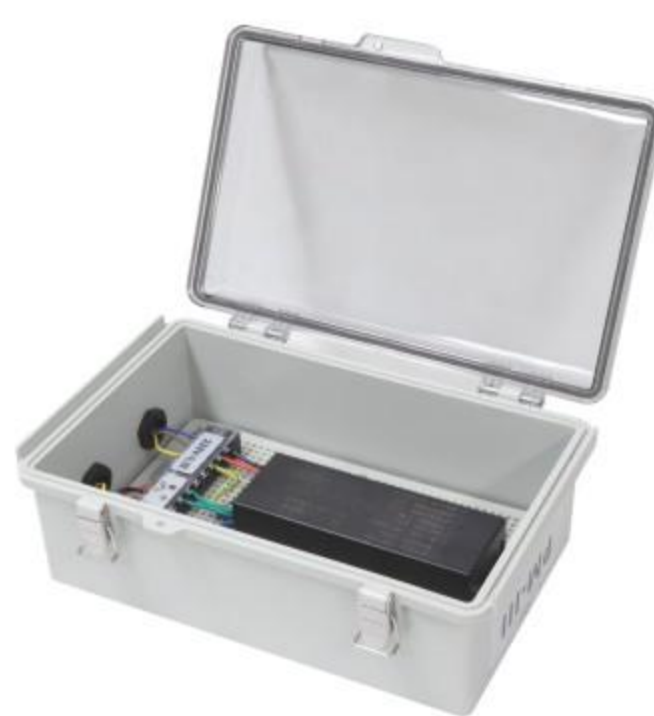
Water Proof And UV Resistant Control Box